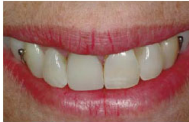
Removable Partial Dentures