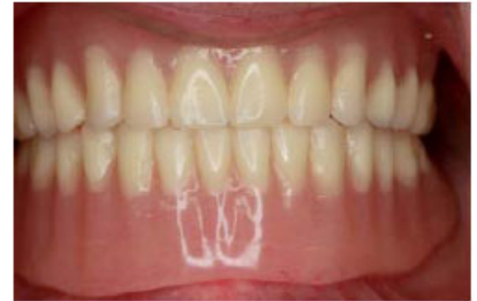
Complete Or Full Dentures