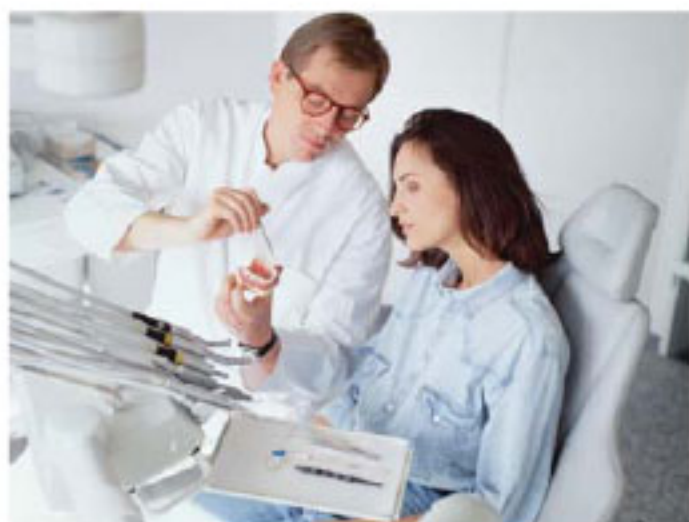
Advances In Science and Technology Offer Improved Options For Replacing Teeth